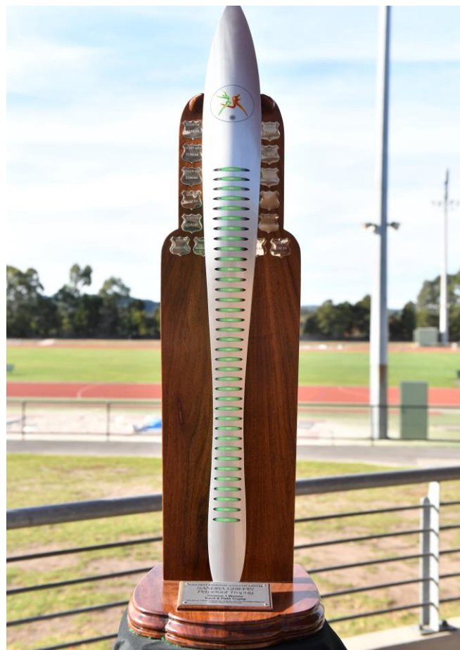
Sandra Griffin trophy - OPEN Women's Trophy